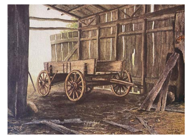
Fleeting Past of the Hills | 14.25" x 20"

Listed next to the name of the print is the size of the image. All of the prints have a white border.