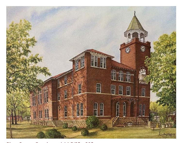
Rhea County Courthouse | 14 5/8" x 20"