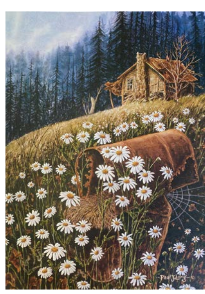
Daisies | 18.75" x 14"