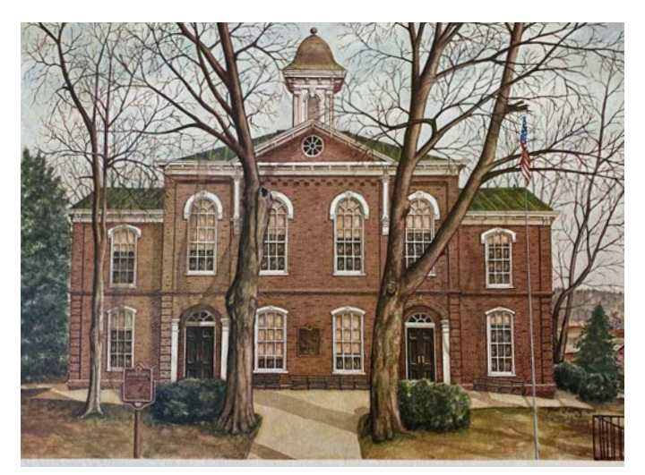
Loudon County Court House | 14 5/8" x 20"