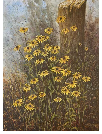
Black-Eyed Susans | 18.75" x 14"