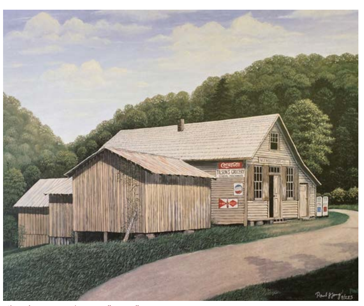
Tilson's Grocery | 14.25" x 20"

Listed next to the name of the print is the size of the image. All of the prints have a white border.