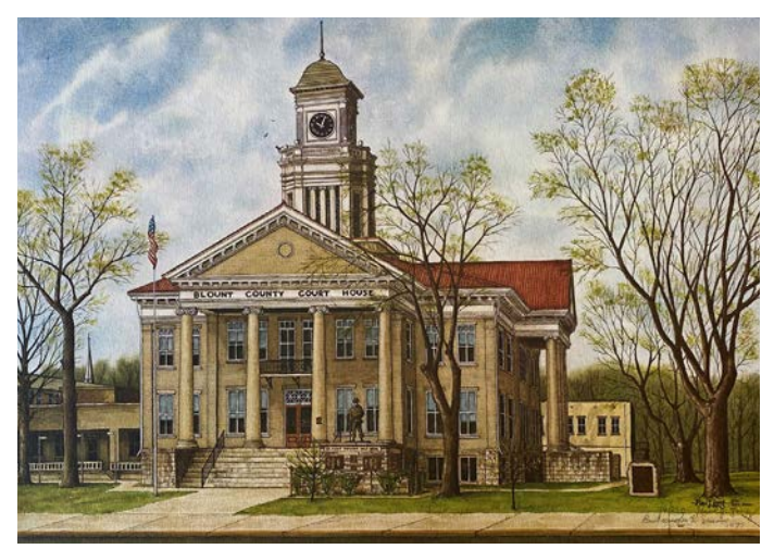
Blount County Courthouse | 14 5/8" x 20"